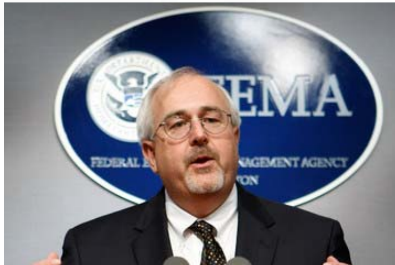
Craig Fugate Former Administrator FEMA