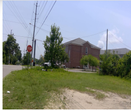
5/18/2022 12:00:00 AM