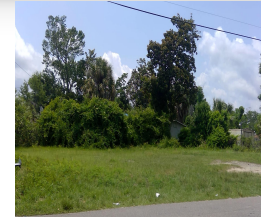
5/18/2022 12:00:00 AM

The primary use of the assessment data is for the preparation of the current year tax roll. No responsibility or liability is assumed for inaccuracies or errors.