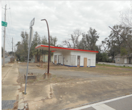
1/5/2022 12:00:00 AM

The primary use of the assessment data is for the preparation of the current year tax roll. No responsibility or liability is assumed for inaccuracies or errors.