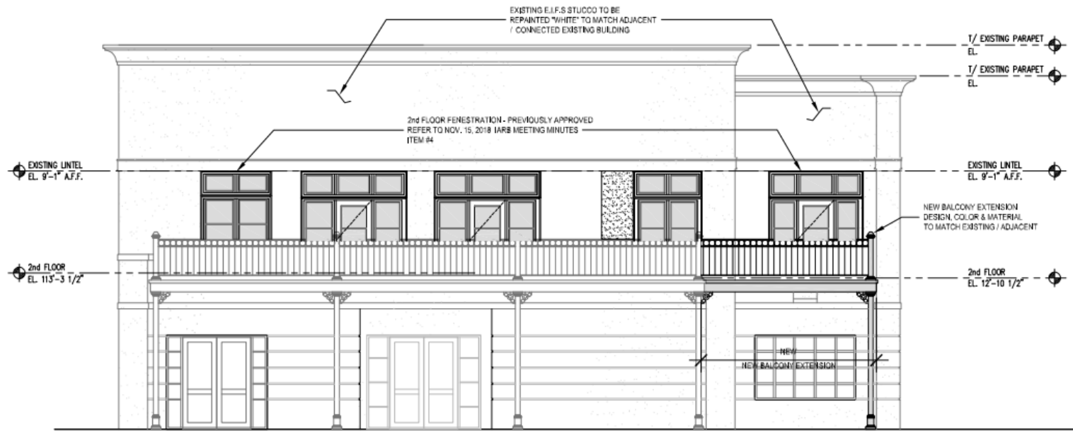
1 WEST ELEVATION (FRONT) A2.1 SCALE: 1/8" = 1'-0"