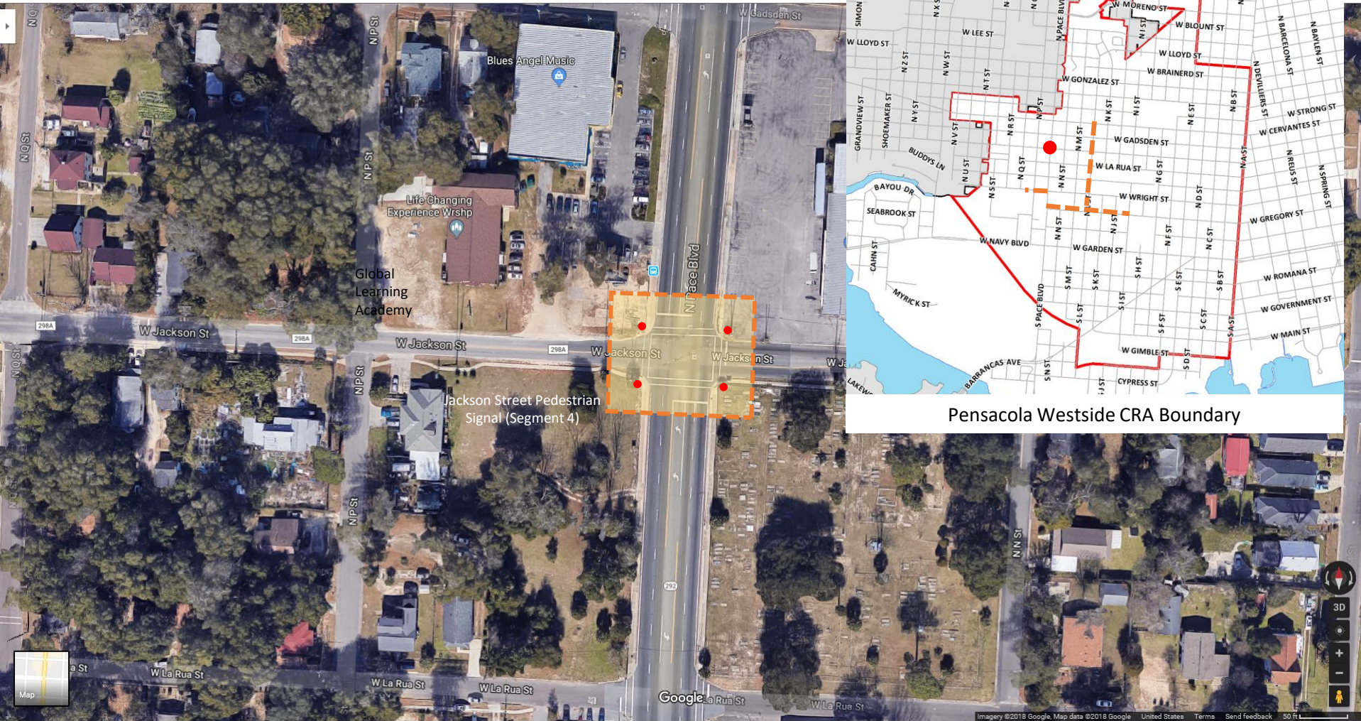
Pensacola Westside CRA Boundary