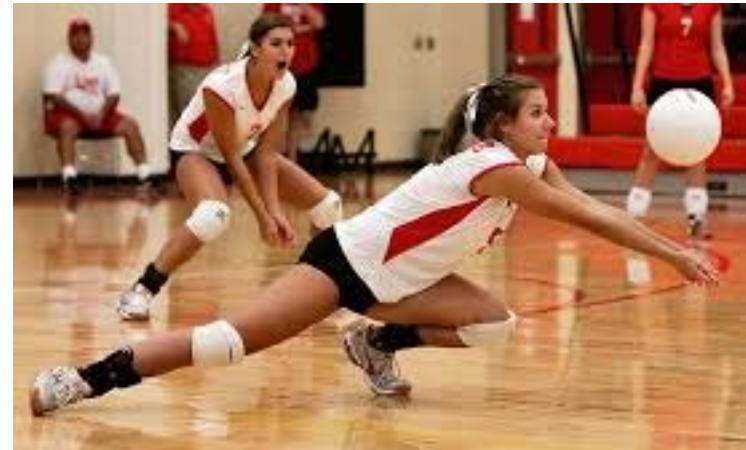
Indoor Volleyball Tournaments