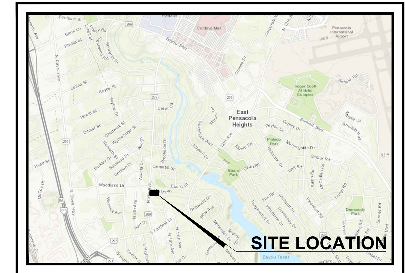
VICINITY MAP 1" = 2000'

DEDICATION: KNOW ALL MEN BY THESE PRESENTS THAT NORTHWEST FLORIDA COMMUNITY HOUSING DEVELOPMENT CORPORATION, OWNER OF THE LAND HEREIN DESCRIBED AND PLATTED HEREIN KNOWN AS GLADES SUBDIVISION, HEREBY AUTHORIZES AND REQUESTS THE FILING OF THIS PLAT IN THE PUBLIC RECORDS OF ESCAMBIA COUNTY, FLORIDA.