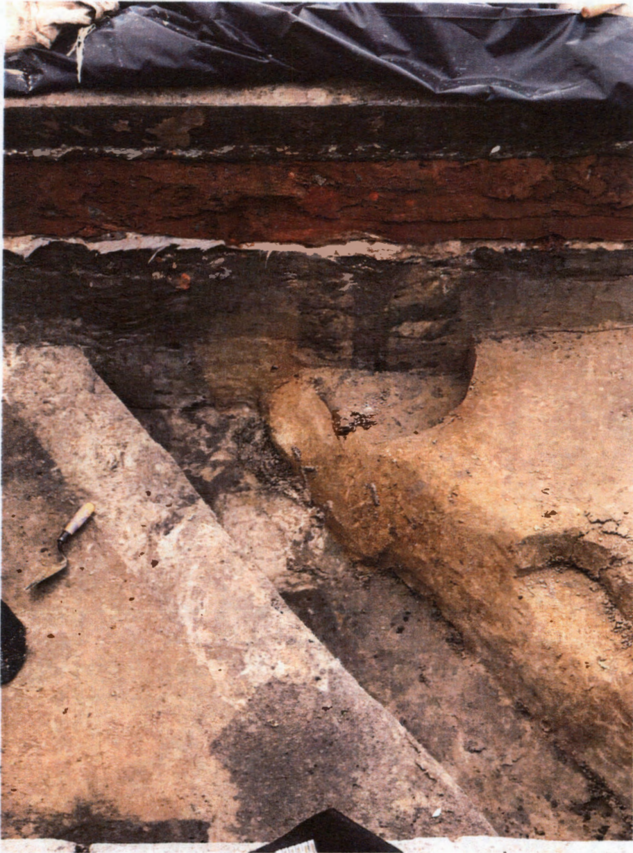
JEFFERSON STREET GULF POWER PROJECT REMAINS OF THE BRITISH FORT OF PENSACOLA 1763-1821