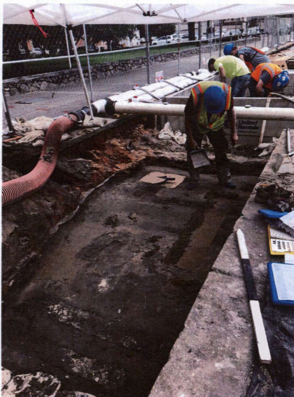
JEFFERSON STREET IN FRONT OF WENTWORTH MUSEUM FLOOR SUPPORTS FOR GUARD HOUSE OF BRITISH FORT AT WESTERN GATE 1763-1821