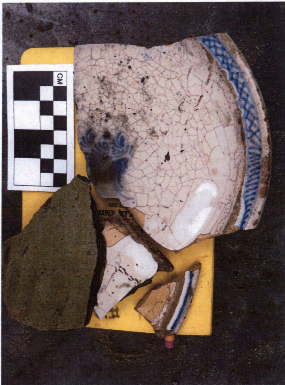
JEFFERSON STREET FRENCH AND SPANISH ARTIFACTS FROM EARLIEST SPANISH BARREL WELL, PROBABLY 1741?