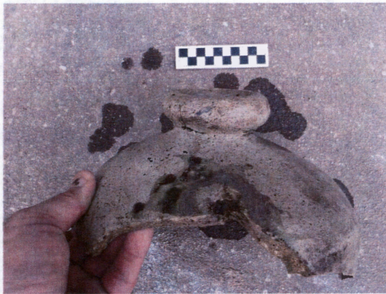
LARGE PIECE OF SPANISH OLIVE JAR JEFFERSON STREET