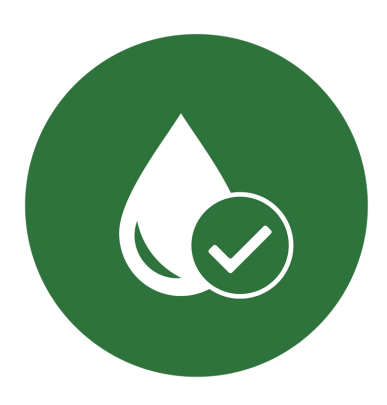
Goal 3 Improve water quality