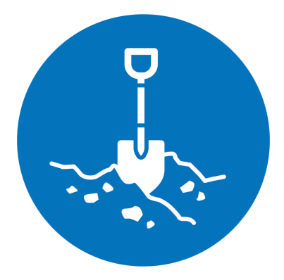
Goal 4 Reduce sediment sources