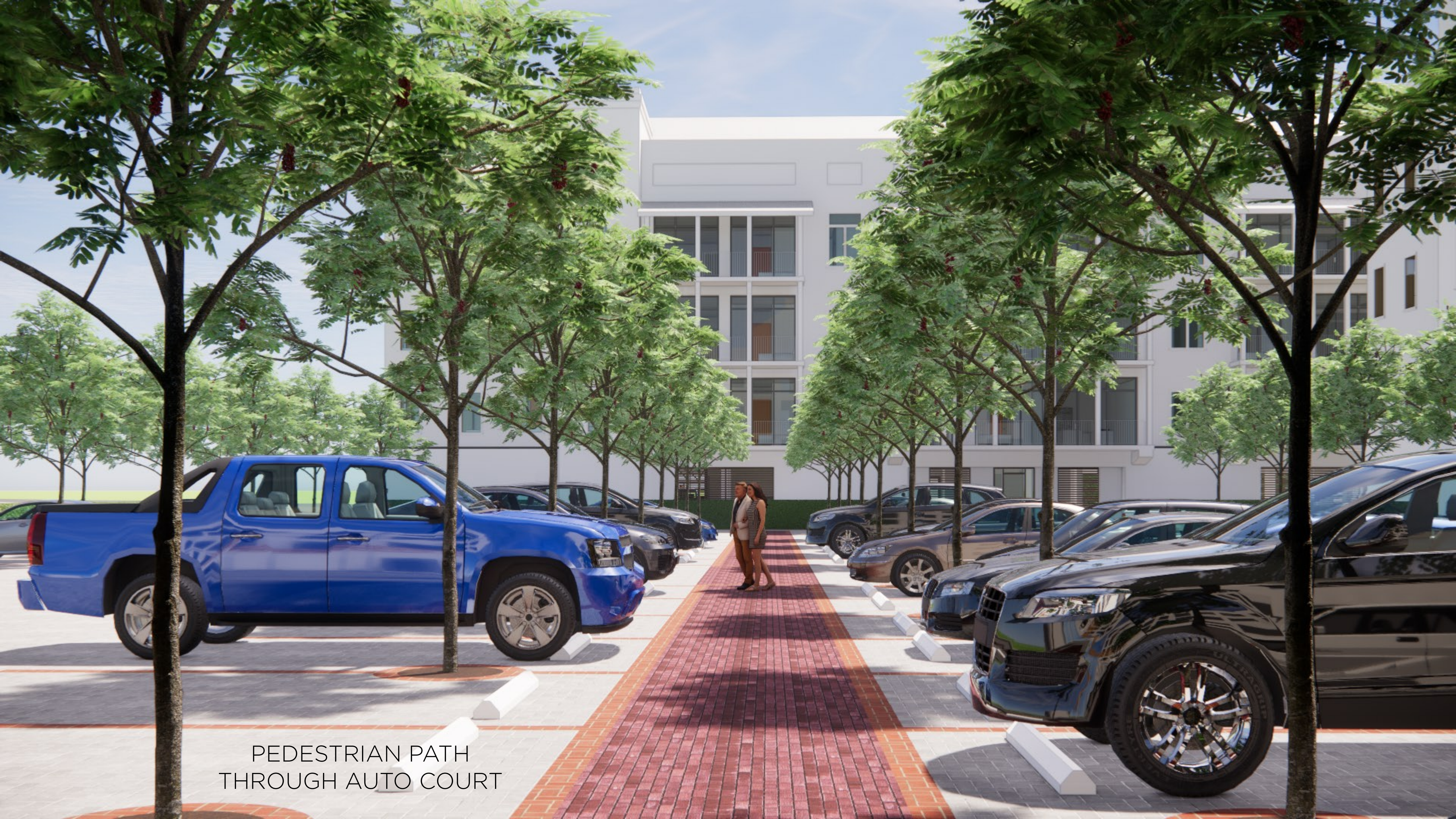
PEDESTRIAN PATH THROUGH AUTO COURT