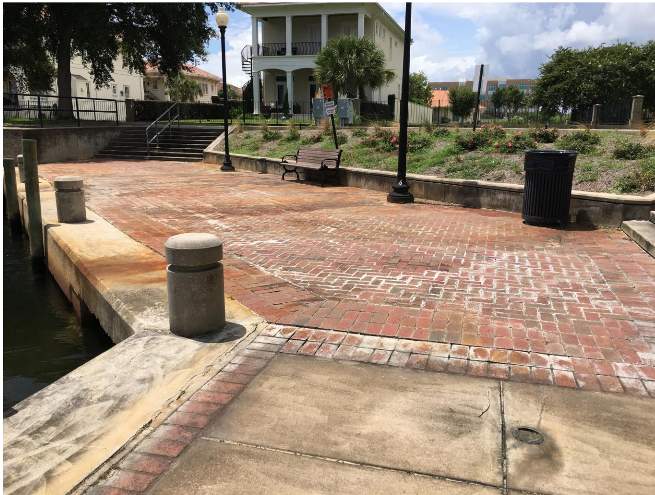
Conditions: Promenade sinking, corrosion, pavers lifting, landscape in poor condition