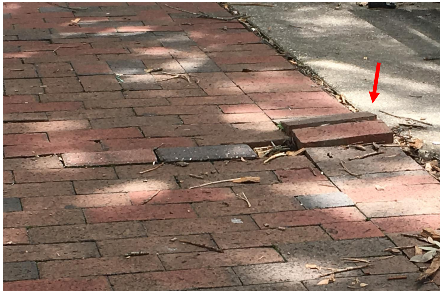
Conditions: Paver lifting, trees/landscape in poor condition