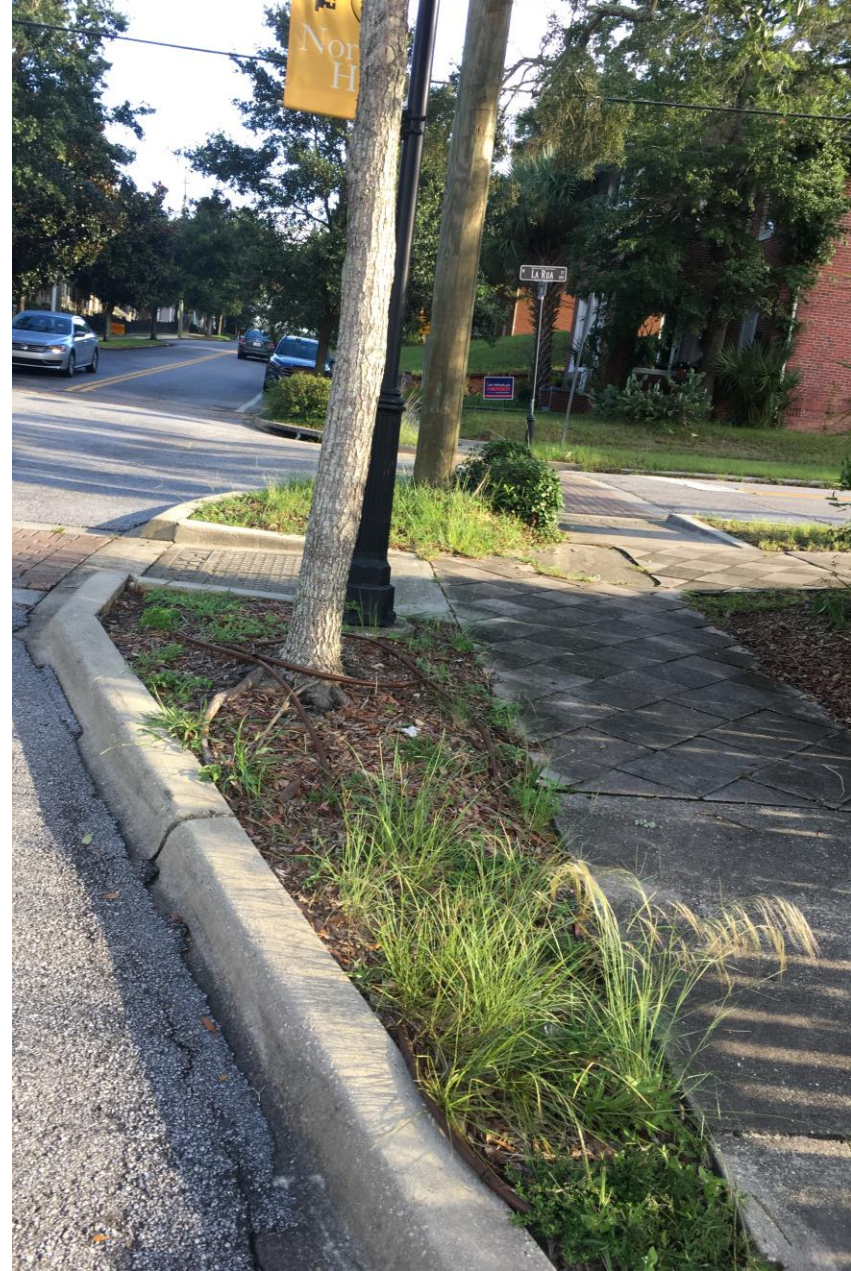
Conditions: Landscape in poor condition, irrigation lines exposed, power washing needed.