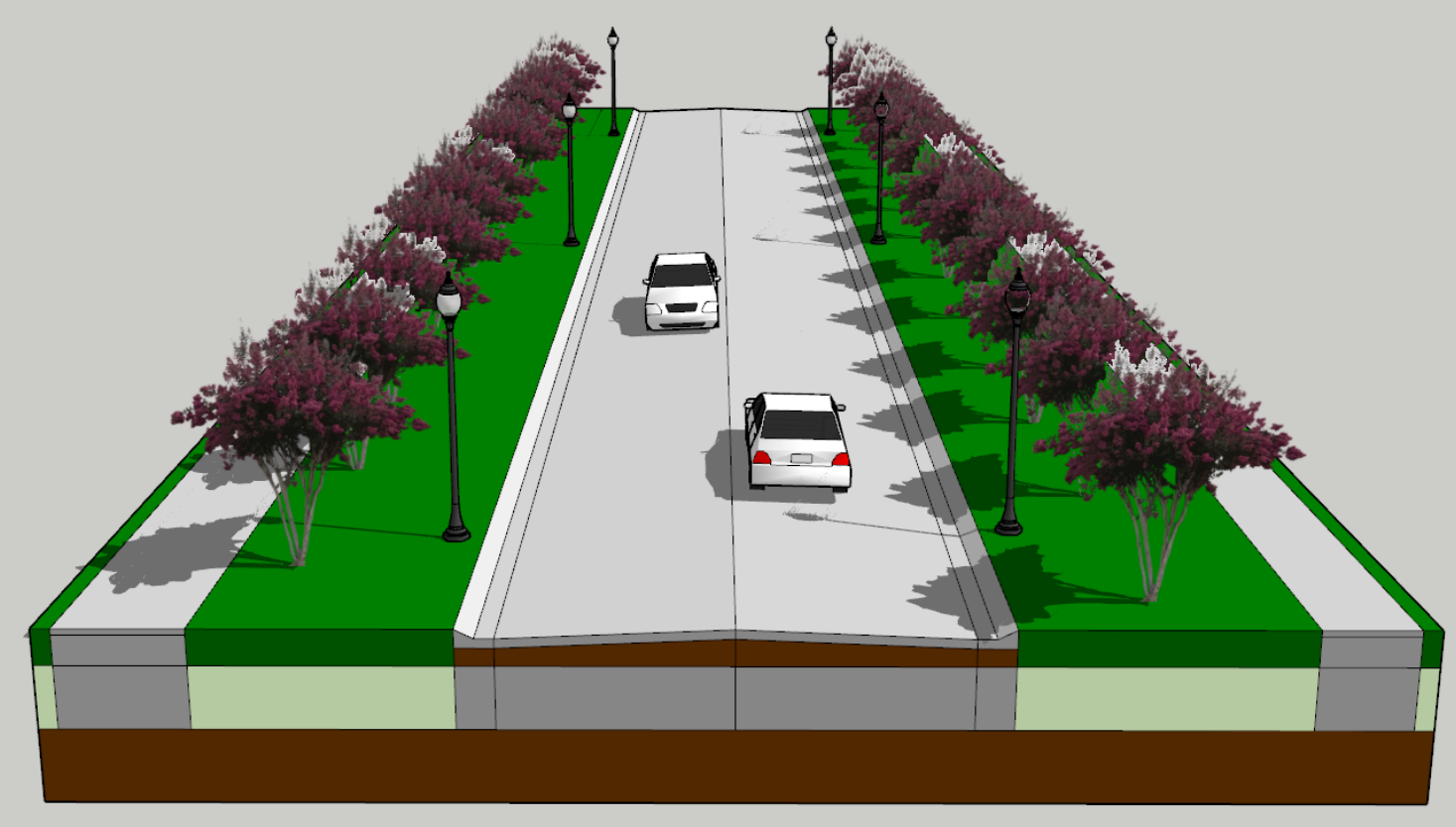
The existing typical section and proposed typical section dimensions are identical. The only additions are sidewalks, street trees, and lighting. No change is proposed for the right-of-way or travel lane widths.