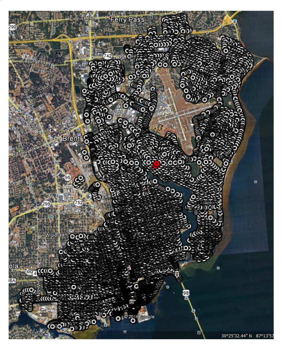
Figure 2: KMZ Representation of Street Light Data Points

Mott MacDonald utilized a sub-meter GPS units to capture and log the location, type, and condition of City street lighting. A designated team performed field work to promote consistency among data collection efforts. Daily coordination among the team provided a systematic method to safely and efficiently collect data which were periodically added to a Google Earth KMZ file to both organize information and track project progress (Figure 2). Data was converted to GIS format to allow for incorporation into the City's existing GIS database.