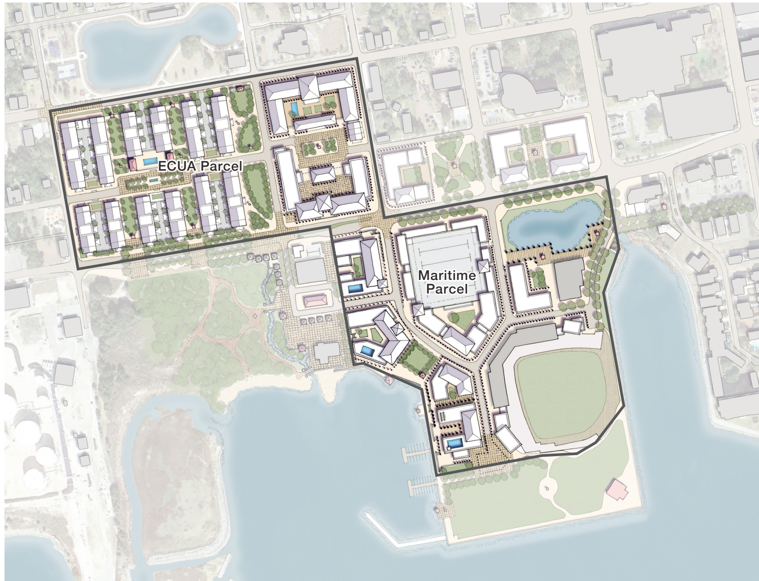
The following pages contain detailed site regulations for the ECUA Parcel and the Maritime Parcel. The list on the right are the specific elements that are regulated.