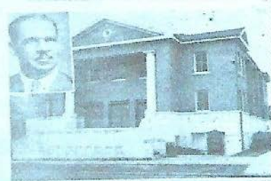
BY GRIVE EXPRISE CHORCH