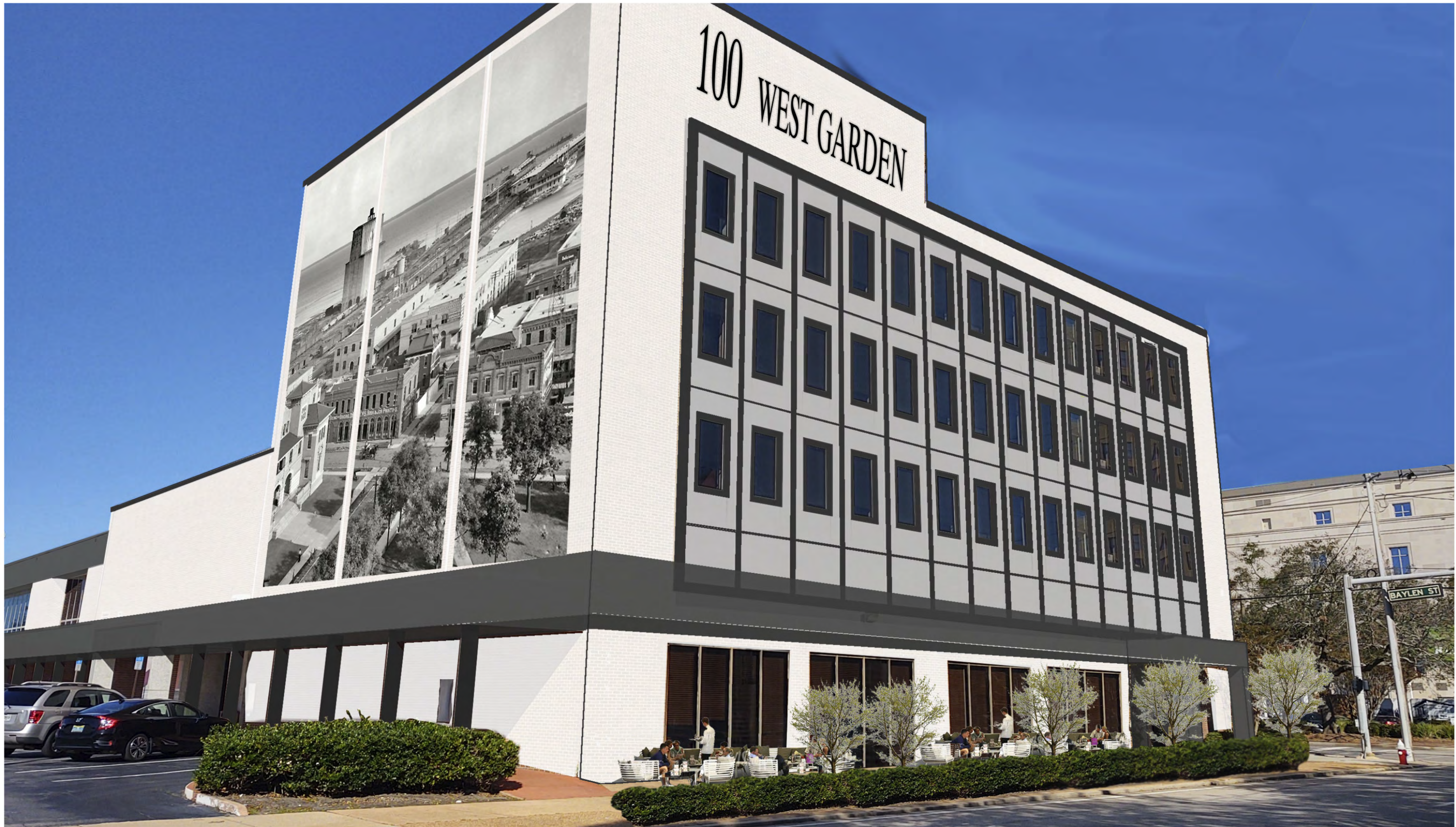
ADAMS HOMES RENOVATION 100 W GARDEN STREET - EXTERIOR SAMPLE 3