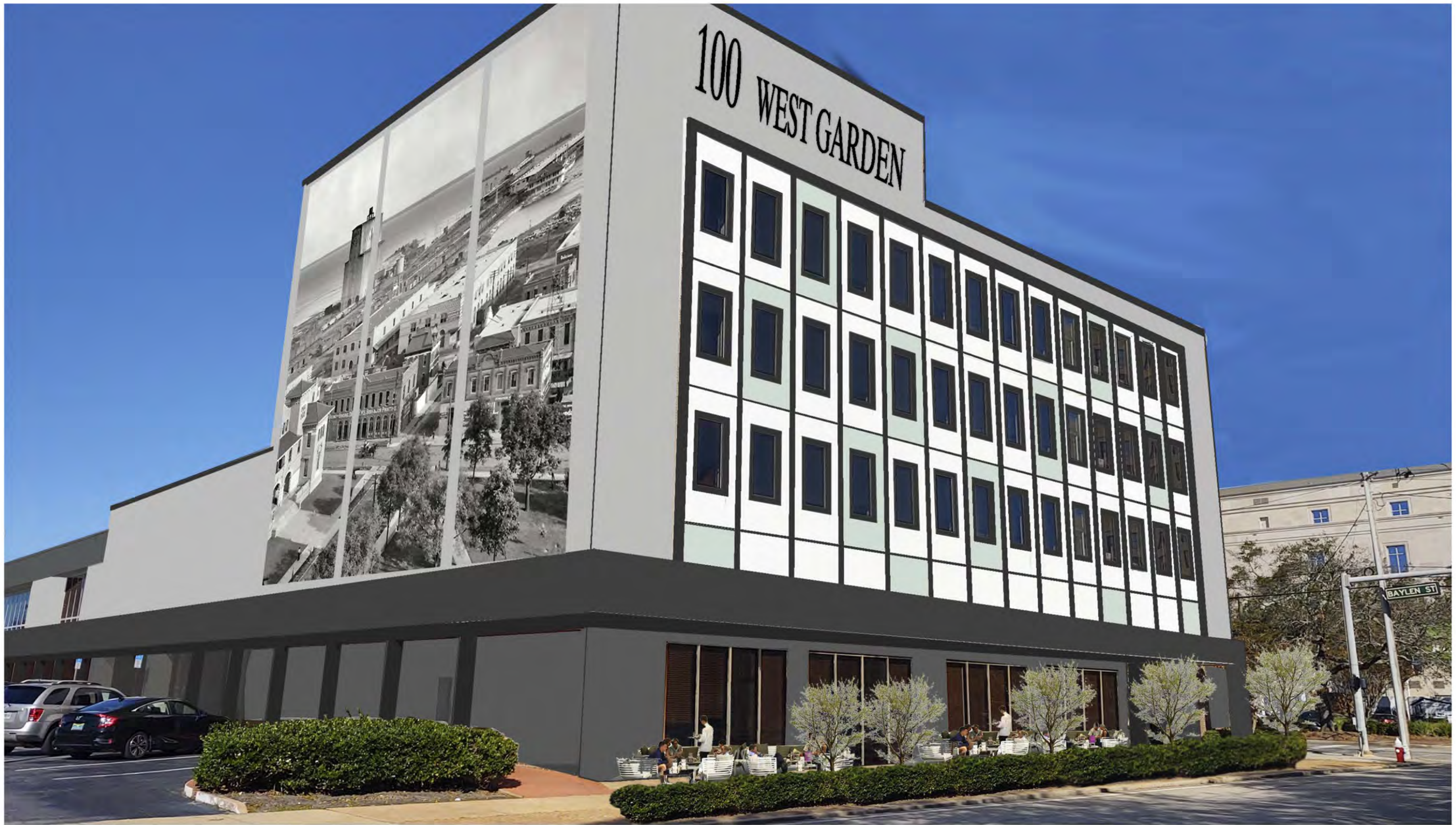
ADAMS HOMES RENOVATION 100 W GARDEN STREET - EXTERIOR SAMPLE 2