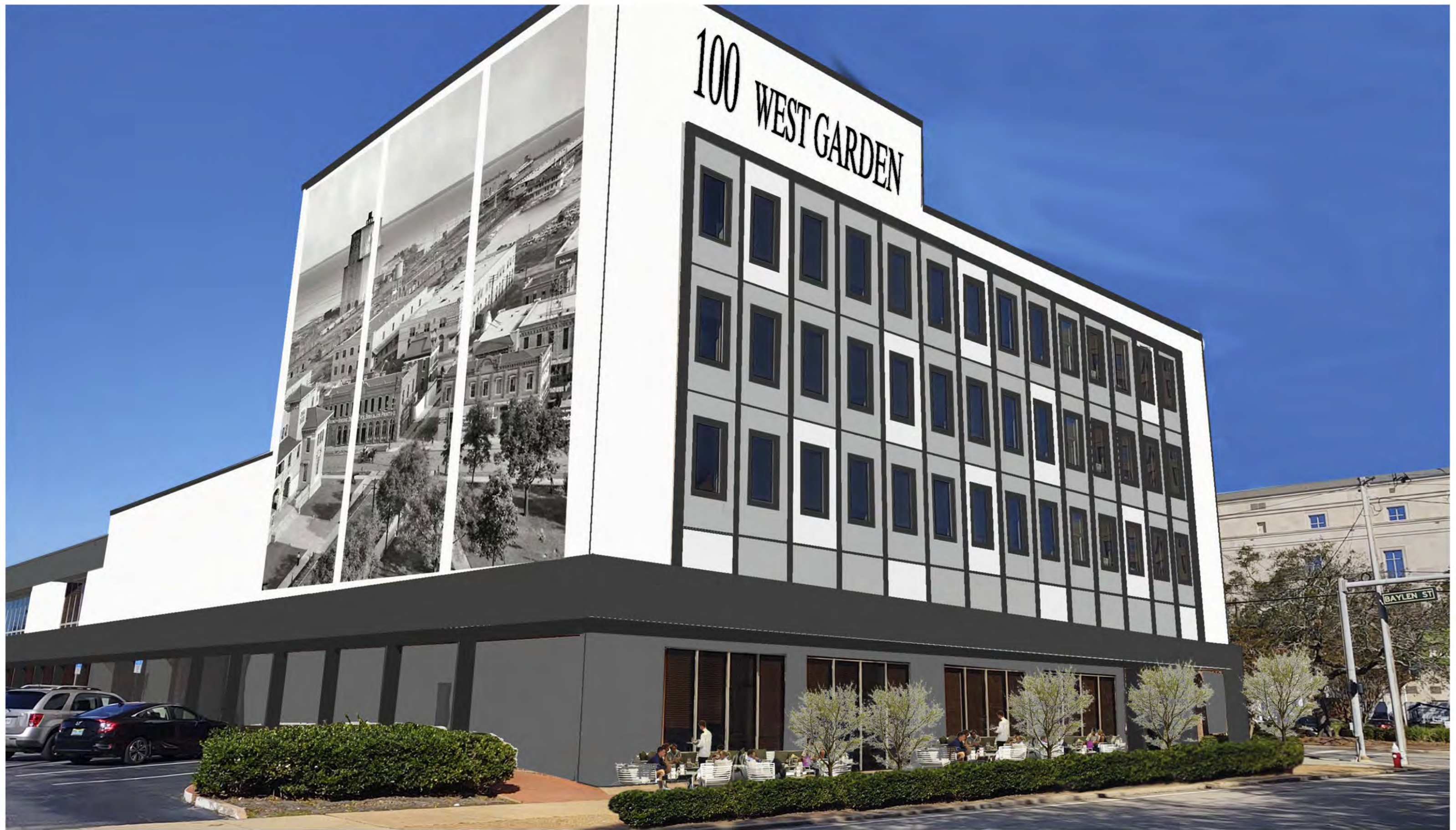
ADAMS HOMES RENOVATION 100 W GARDEN STREET - EXTERIOR SAMPLE 1