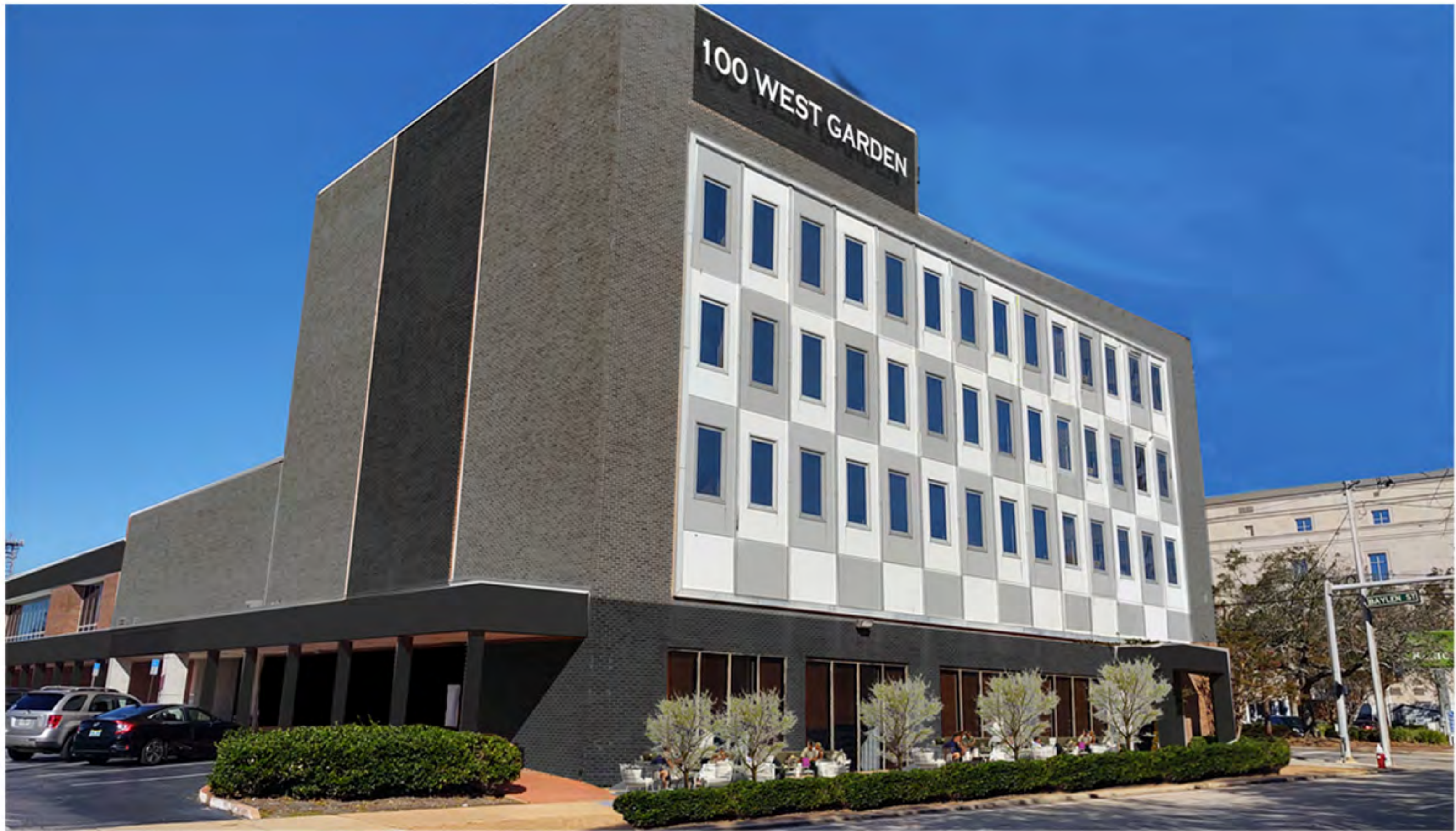
ADAMS HOMES RENOVATION 100 W GARDEN STREET - EXTERIOR SAMPLE 5