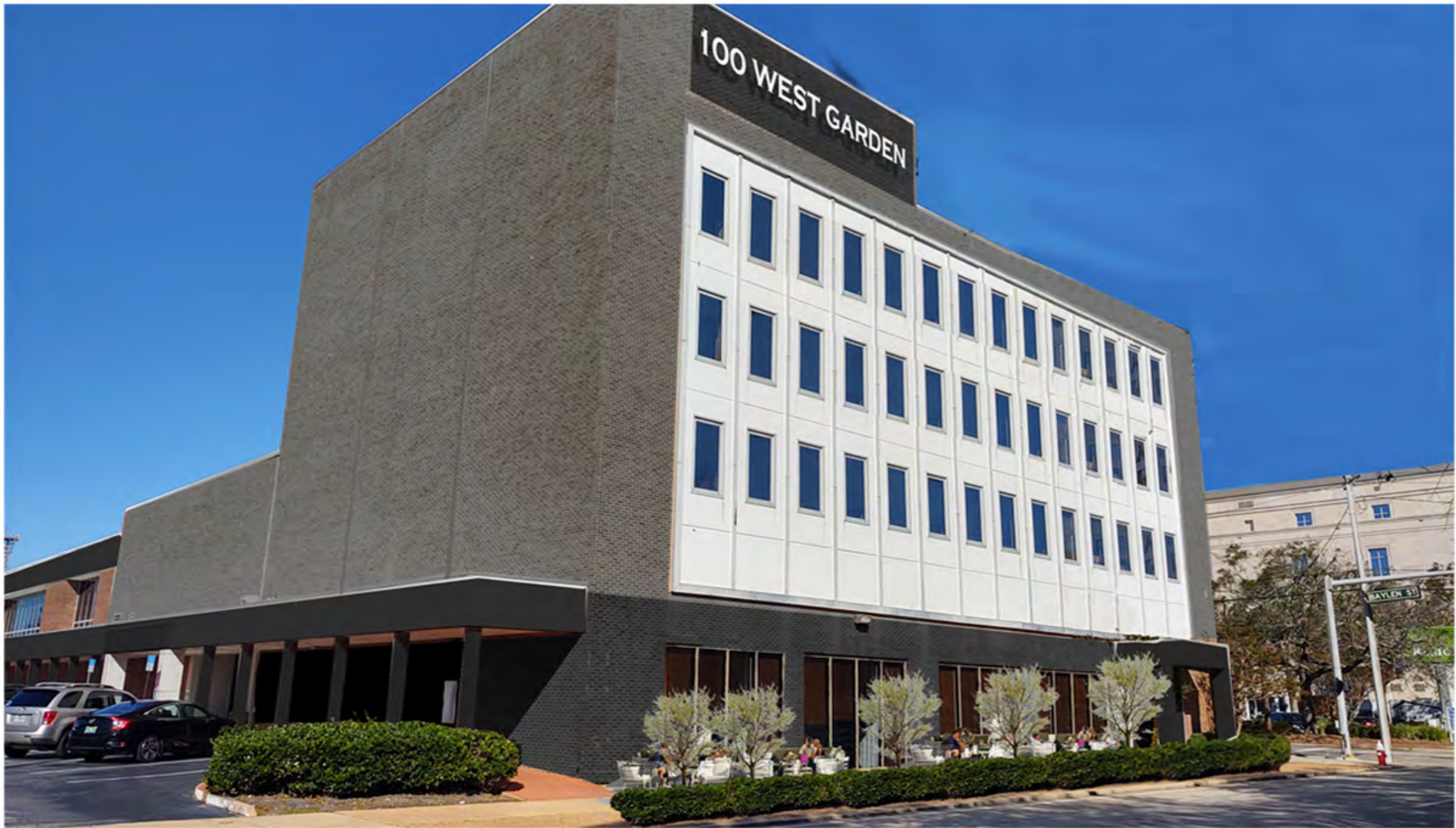
ADAMS HOMES RENOVATION 100 W GARDEN STREET - EXTERIOR SAMPLE 6