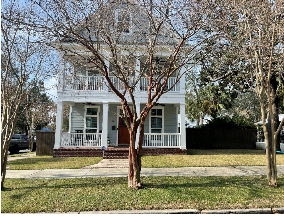
Side of Home (standing on Strong Street)