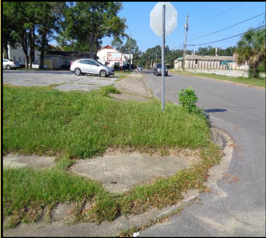
No curb cut, broken, overgrown