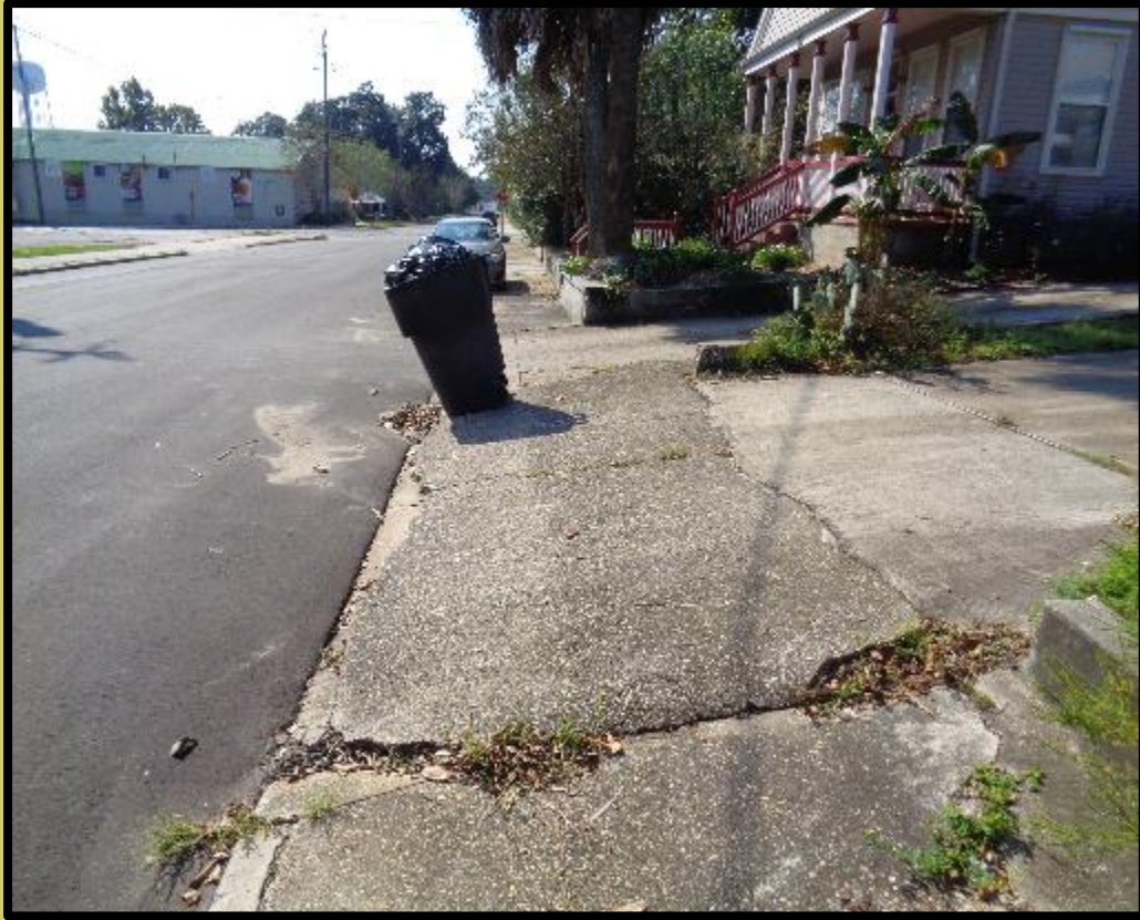
Broken, slanted obstructions