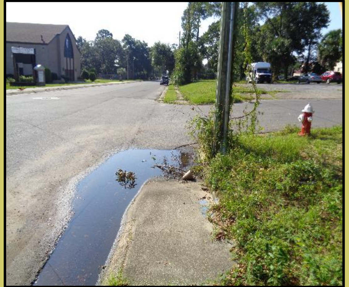
Water pools at curb cut, debris