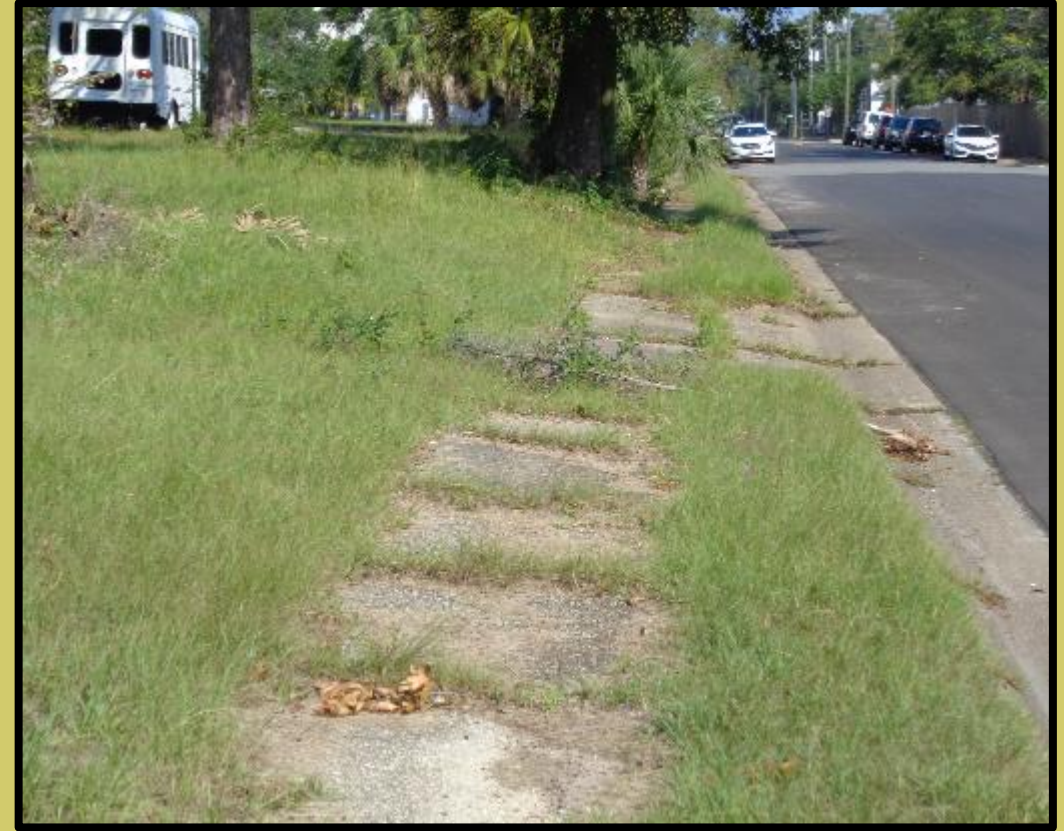
Broken, over ground with vegetation