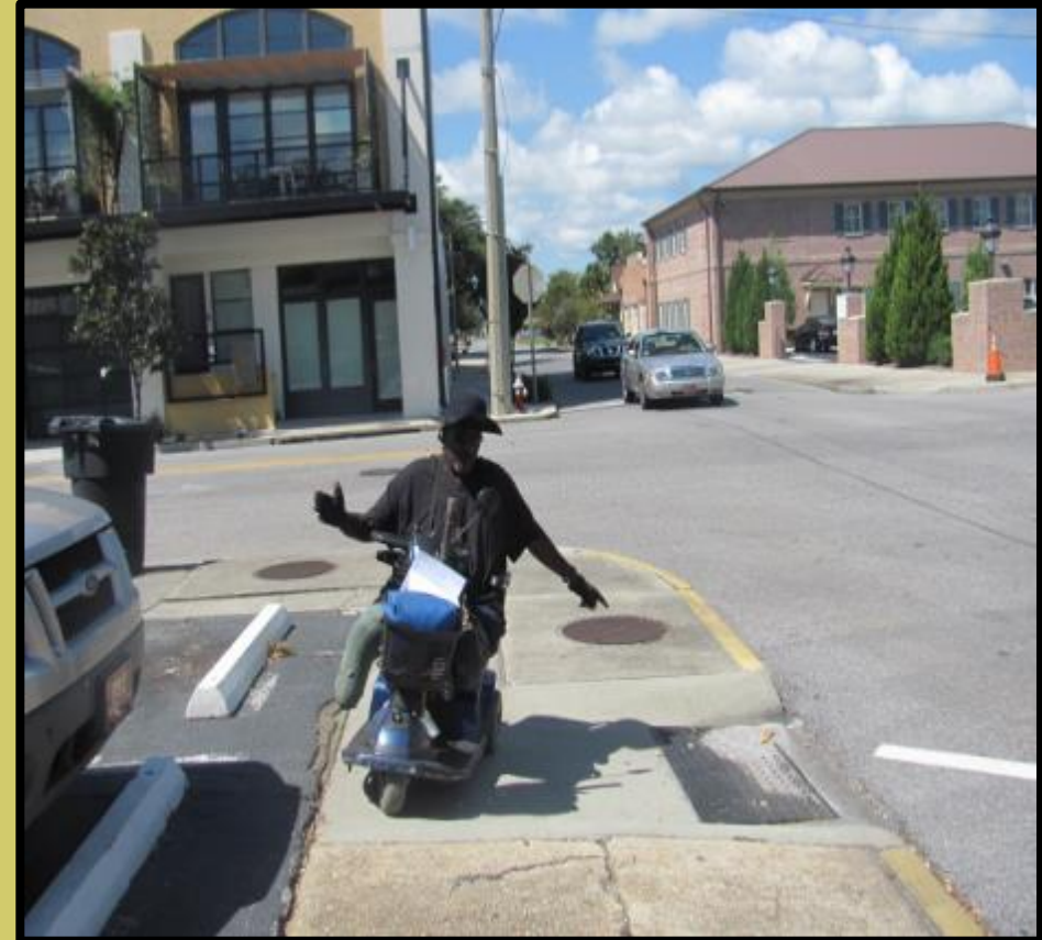
Wrong curb cut