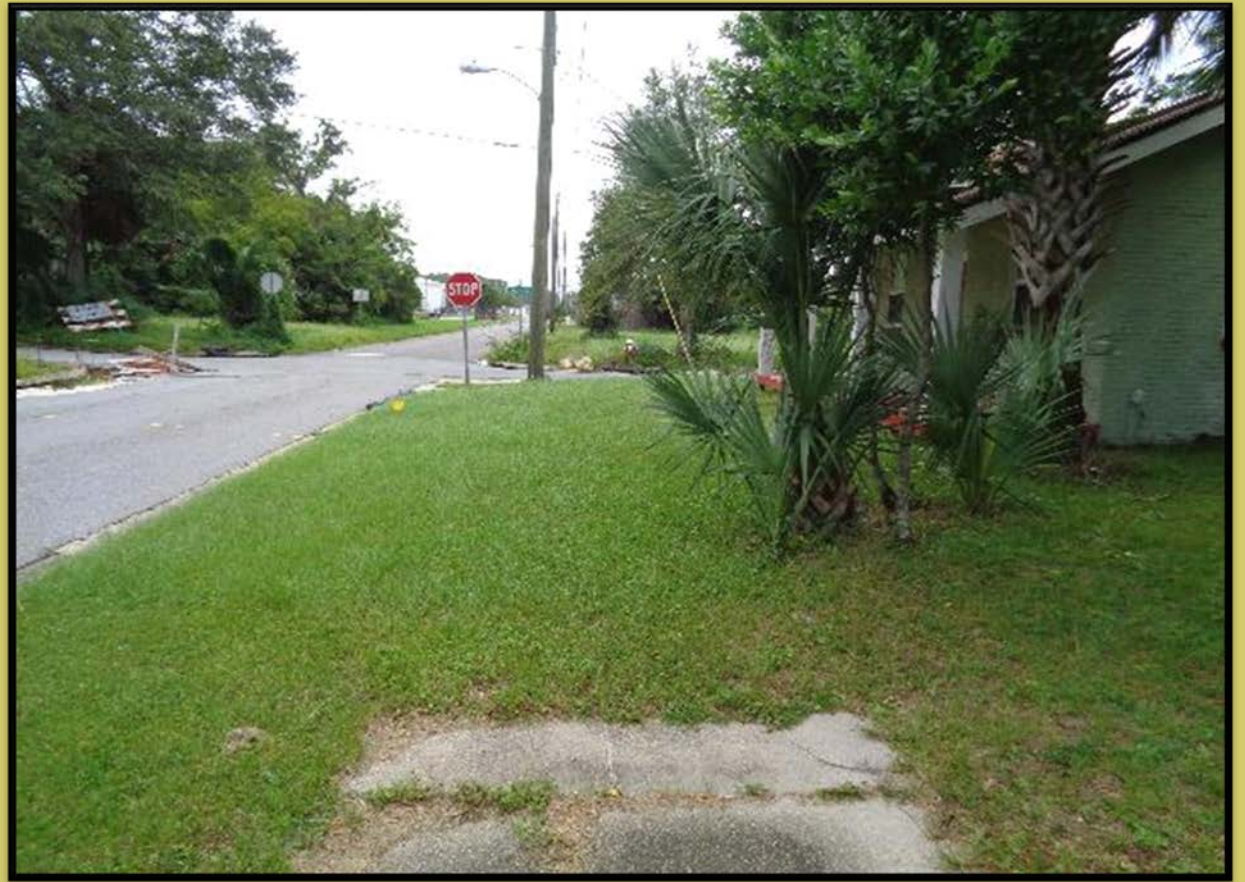
Sidewalk disconnected, broken, vegetation