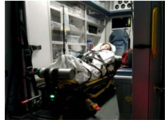
A Petland employee and victim of drug-resistant Campylobacter infection on her way to the hospital. The HSUS