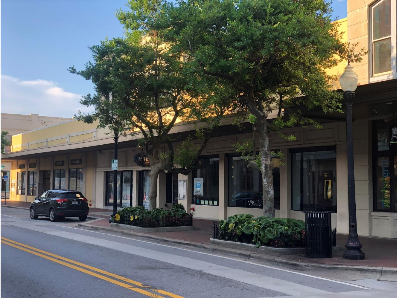
VIEW LOOKING SOUTH ON PALAFOX PLACE