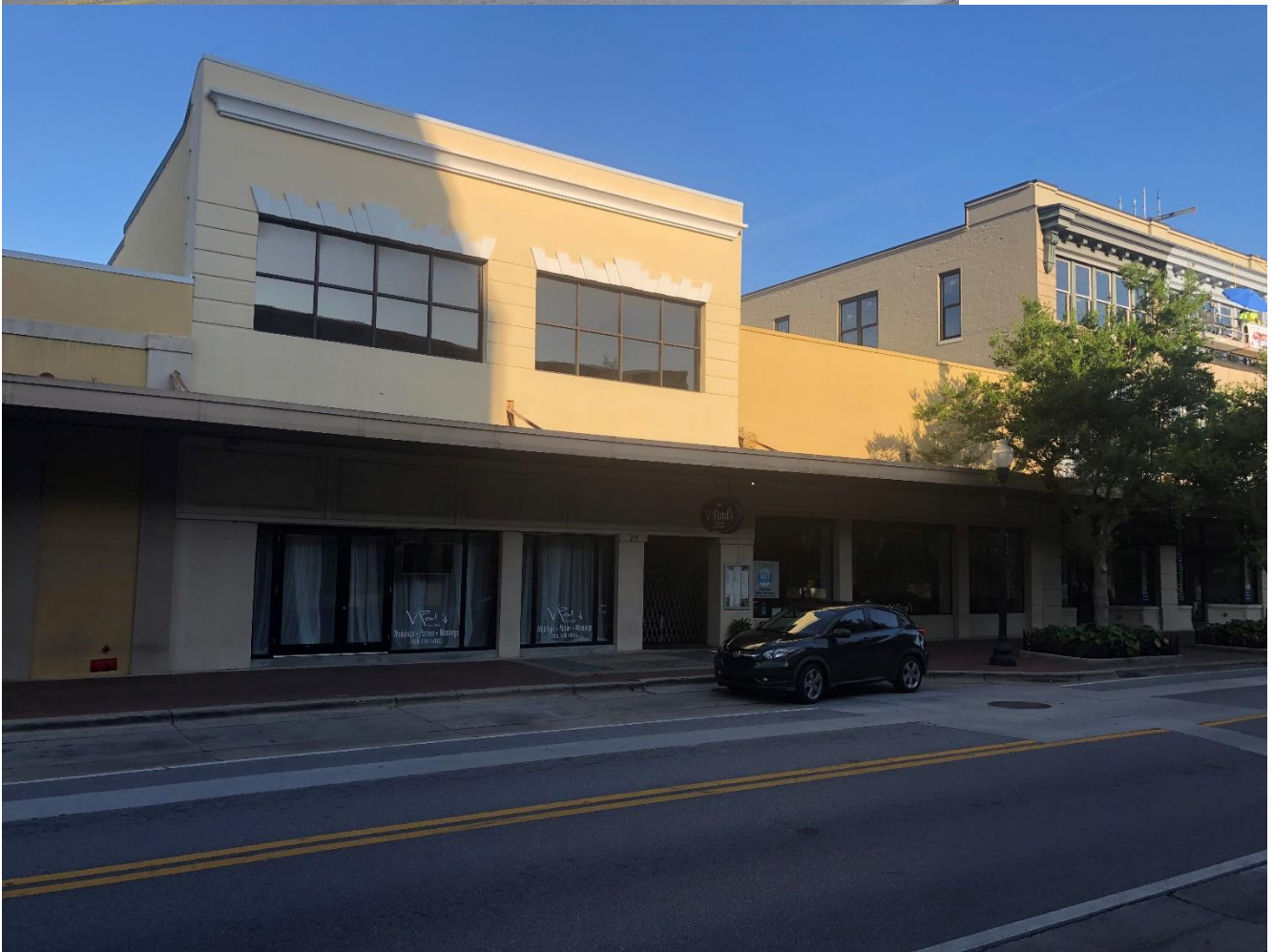
TWO VIEWS OF 29 PALAFOX PLACE