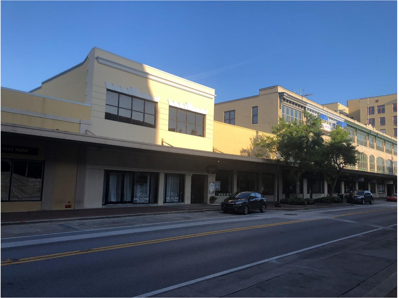
VIEW LOOKING NORTH ON PALAFOX PLACE