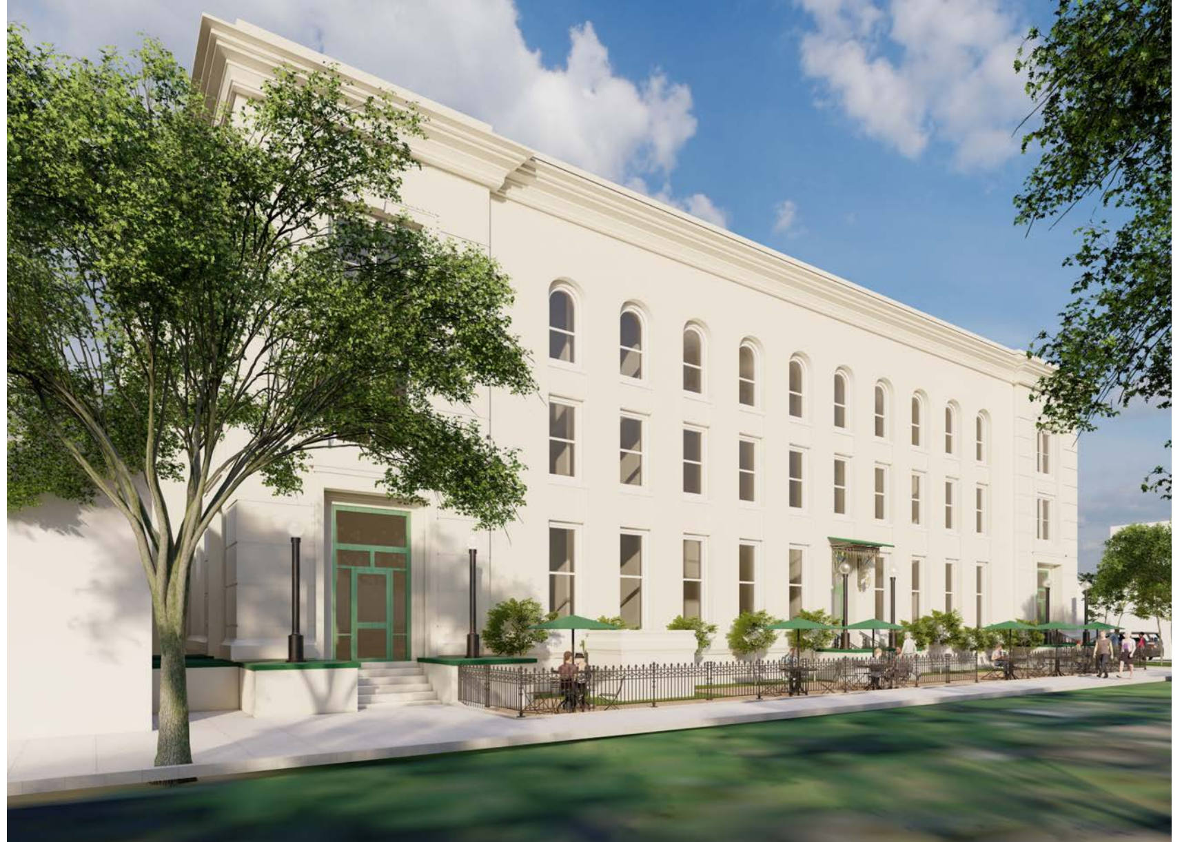
Existing Condition View above with Concept Sketch to the right. Bottom rendering shows new canopy, entry and stoop to the existing courtyard.