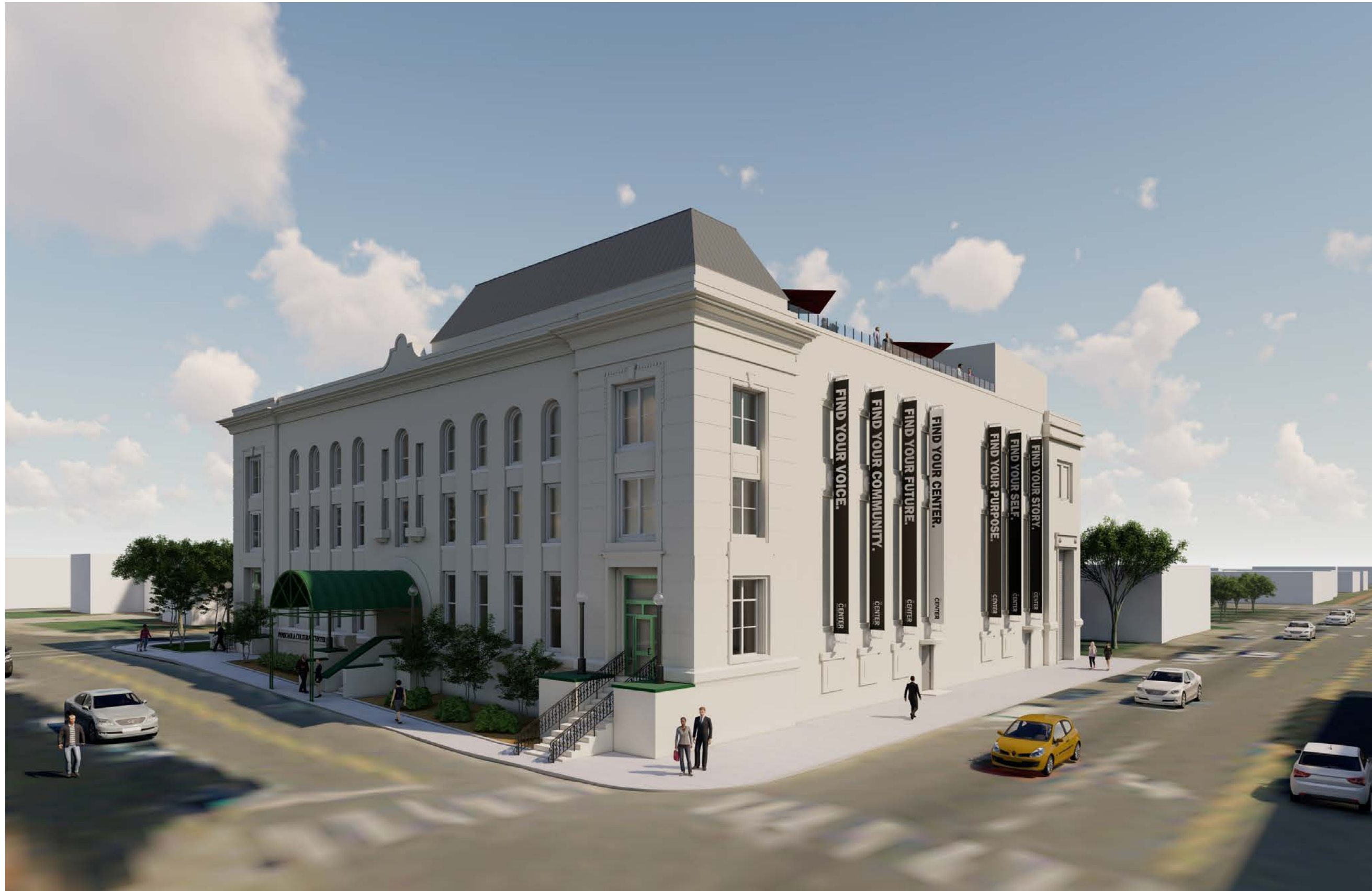
View of Pensacola Cultural Center from Main and Jefferson Streets showing mansard roof addition and new banners for the existing south elevation banner wall. All supports are existing.