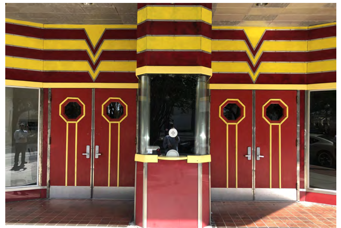
Showing full entrance