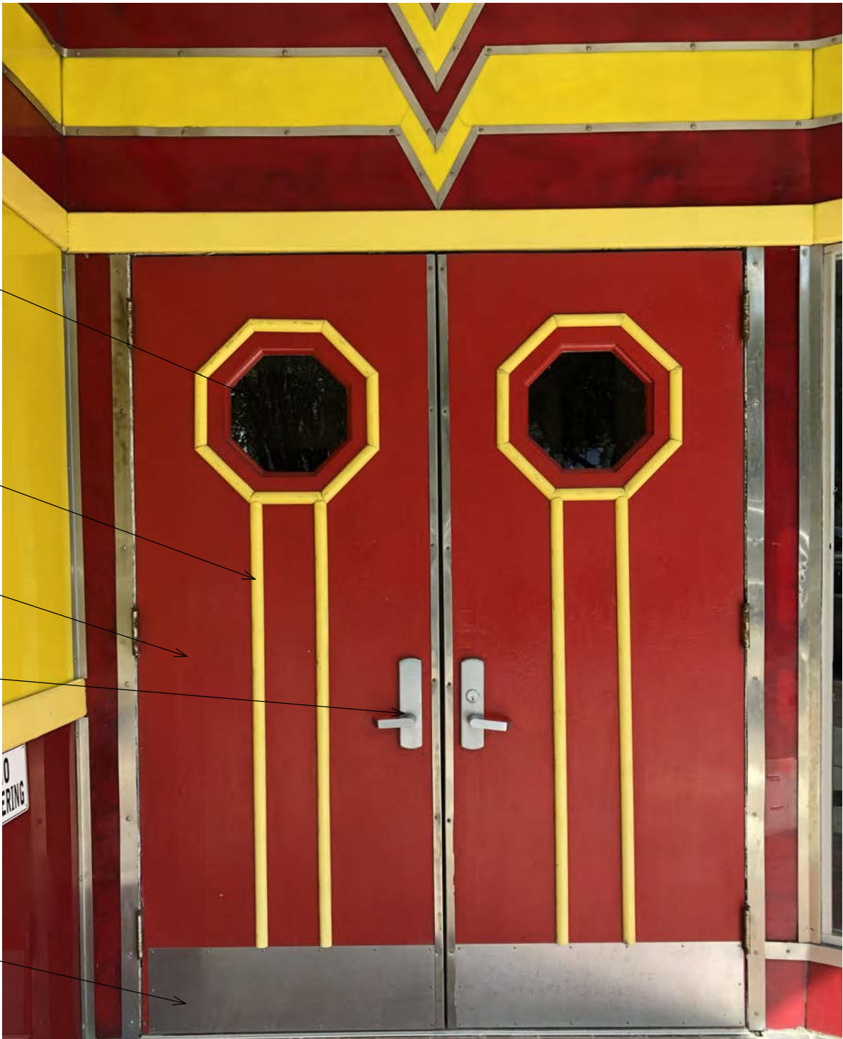
Photo of Existing Door