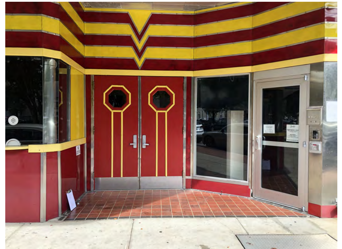
Showing context of other doors and windows